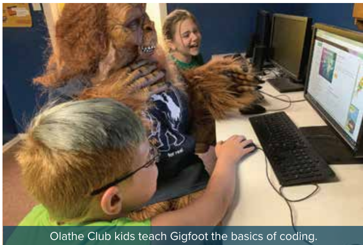
Olathe Club kids teach Gigfoot the basics of coding.

Nestled among acres of fertile farm ground, with a population of just shy of 2,000, Olathe is known for exactly what you'd expect: rich agriculture, one stop light, and to-die-for sweet corn. But appearances are deceiving here, and all you have to do is walk through the doors at the Olathe unit of the Black Canyon Boys & Girls Club (BCBGC) to see it.